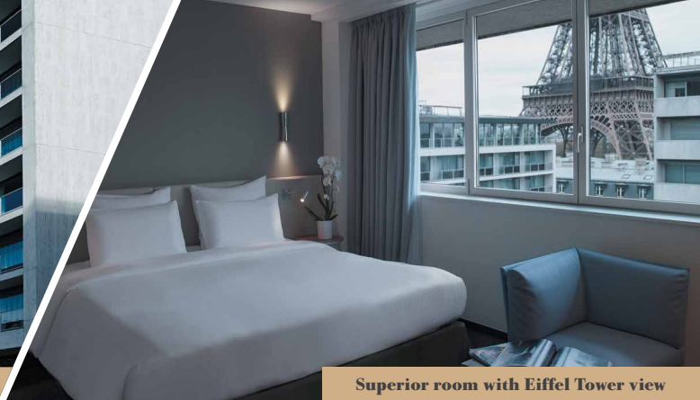
Superior room with Eiffel Tower view