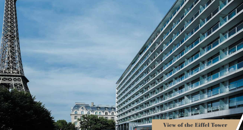
View of the Eiffel Tower