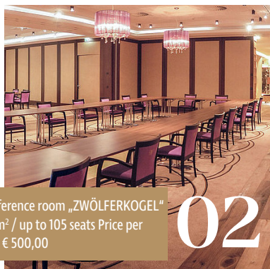
Conference room „ZWÖLFERKOGEL“ 108m 2 / up to 105 seats Price per day: € 500,00