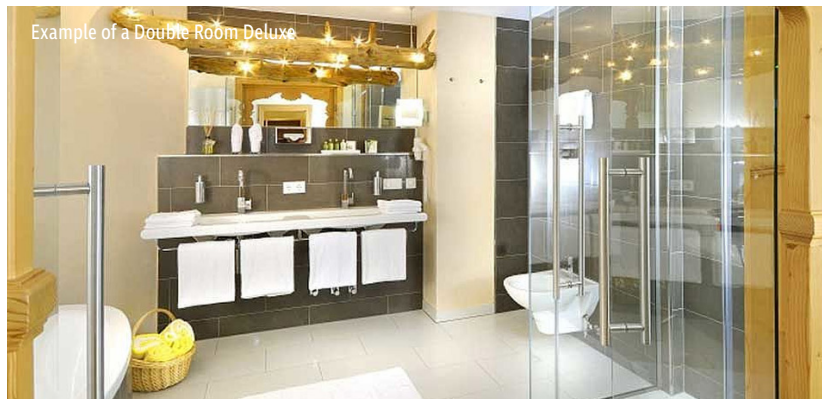
Example of a Double Room Deluxe

Enjoy top-class elegance and comfort, which will give you new energy and motivation for your event or conference.