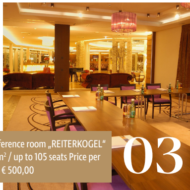
Conference room „REITERKOGEL“ 108m 2 / up to 105 seats Price per day: € 500,00