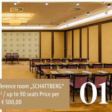
Conference room „SCHATTBERG“ 99m 2 / up to 90 seats Price per day: € 500,00