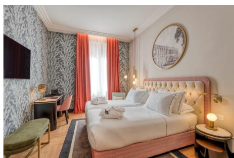
SUPERIOR ROME ROOM

Bathroom with hairdryer and magnifying mirror