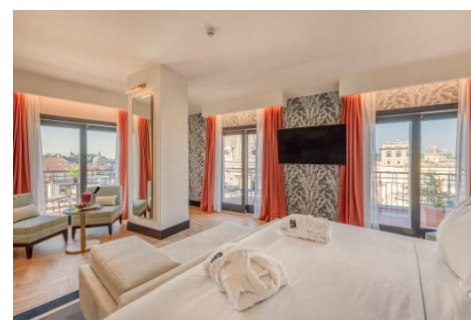
PANORAMIC VENEZIA TERRACE ROOM

Classic Rome Rooms: Comfortable rooms measuring 20 m 2 with an elegant design that combines classic elements with a more contemporary touch. Large windows overlooking the city.