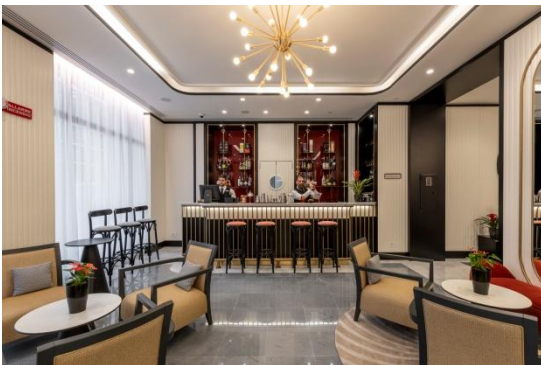
MASSIMO LOBBY BAR

Lucio Restaurant: the hotel's main restaurant offers a unique and elegant atmosphere.