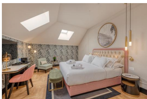
SUPERIOR ATTIC ROOM